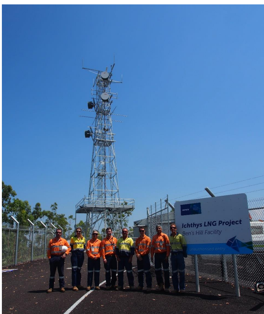
The team from JKC and idec standing proudly at the foot of the 30 metre communication tower on Ben's Hill at the East Arm industrial area, which has a robust earthing network, including six deep earth rods to protect its communications assets from lightning strikes.

Atop Ben's Hill at the East Arm industrial area sits a newly-constructed 30 metre communication tower for the Ichthys Project Onshore LNG Facilities.